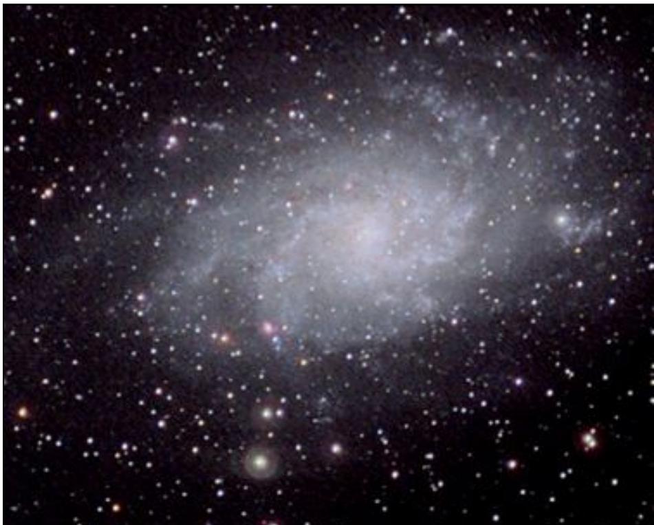
This shot of M33 by Steve Barnes is an LRGB (Luminance Red-Green-Blue) composite. The Luminance frame (containing the fine detail) is a stack of 6 ten minute exposures with a Finger Lakes CCD camera on a TeleVue 101mm refractor at f/5.4. The RGB (colour portion) is a single 20 minute exposure on Fuji Provia 100F slide film through a Celestron 8" f/1.5 Schmidt Camera. Both shots were taken at the same time riding on a Losmandy GM8 mount autoguided with an SBIG STV using the efinder.