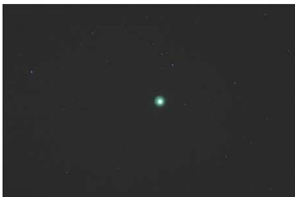
8 Second exposure