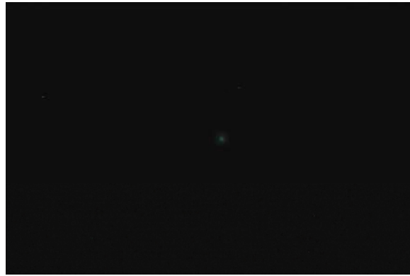
1 second exposure