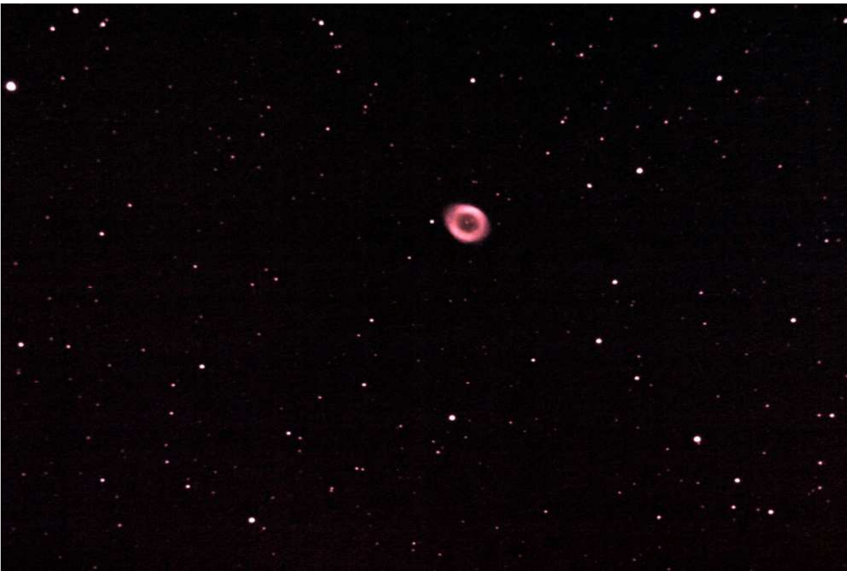
M57 in Lyra

If Lyra seems to be an obscure constellation, its significance is established by the prominence of Vega. Vega is the third brightest star in the sky, surpassed in apparent luminosity only by Sirius and Arcturus. This is so because of this bluish white star's comparative proximity, only 25 light years away. Vega's greater significance has an historical basis, however, for it's eminent distinction lies in that it was the pole star twelve thousand years ago. And so it was the star by which north was determined.