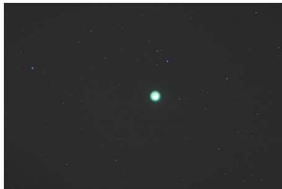
15 Second Exposure