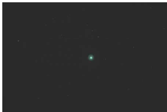
4 second exposure