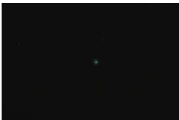
2 second exposure