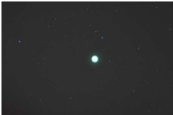
30 Second exposure

Comet Holes from Milton—taken with a Canon 10D at ISO 800 through a Williams Optics 80mm f/6 Zenithstar