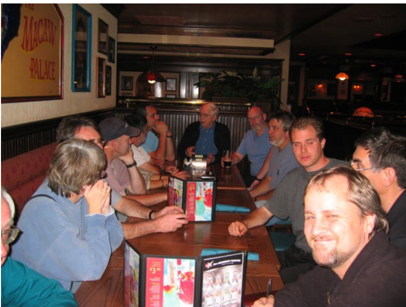
After the regular meeting, many members visited Kelsey's on Highway 20 near Barton street, to talk observing, and share their success with the recent projects and the eclipse.